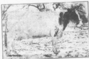
Witzzyde Evangeline Dekol , butter in 7 days 31 lbs., milk 605.1 lbs.; best day 98 lbs. She is one of our best cows; weighs 1,500 lbs.; is due to freshen in March and should increase her former record.

All Cows in above column will be in the sale.