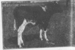
King Segis Alcartra Calamity , our $2,000 35-lb. show bull. Sired by the $50,000 bull.

KING was first prize and Junior Champion at London in 1915, second prize two-year-old at Toronto and London in 1916. Is sire of the Junior Champion male at Sherbrooke 1916 and 1917, and also of the first prize bull calf at Toronto, London and Guelph in 1917, and the first prize yearling bull in 1918.