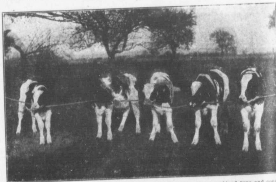
Sons and daughters of King Segis Alcartra Calamity. They have combined type and constitution and are making good.

IN this sale there will be more of the offspring of a 35 lb. sire, more cows bred to a 35 lb. sire, more males and females whose two nearest dams average over 30 lbs. in 7 days than has ever been offered in Canada before. There will be sons and daughters of former Canadian Champions and there will be offered for the first time in Canada a 30 lb. cow carrying a calf to a brother of the $106,000 bull, and a bull ready for service by the same sire. In all 12 bulls will be sold. They are the best lot of bulls ever offered for sale in Canada.