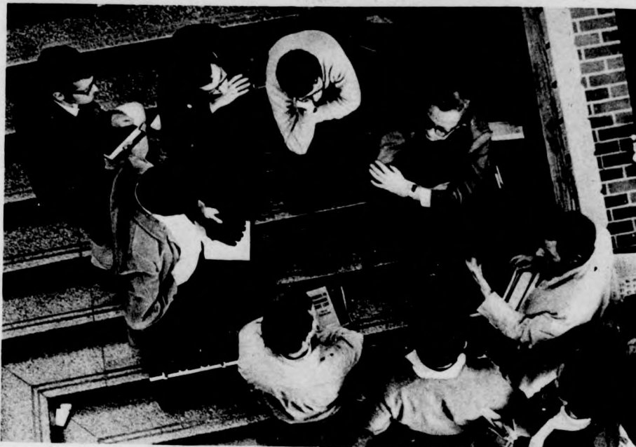
A view from the top of the bottom of the Osgoode pile striving to reach the top of the pile.

Halifax • Saint John • Quebec • Montreal • Ottawa • Toronto Hamilton • Kitchener • London • Windsor • Thunder Bay • Winnipeg Regina • Calgary • Edmonton • Vancouver • Victoria