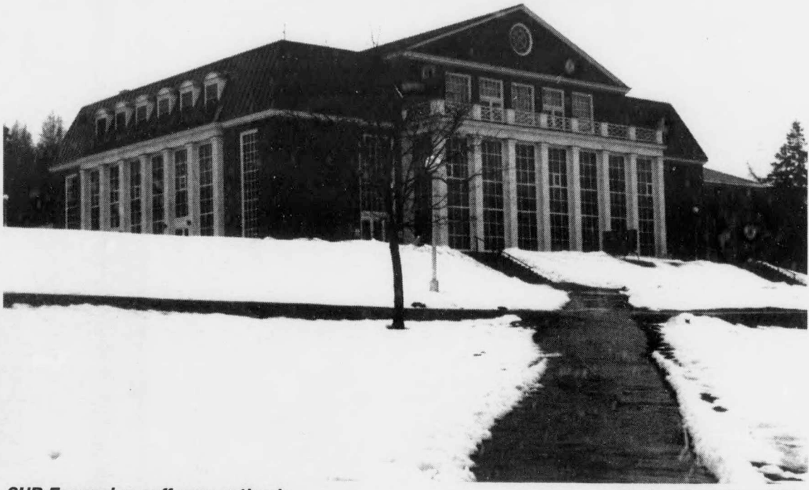
SUB Expansion suffers a setback.