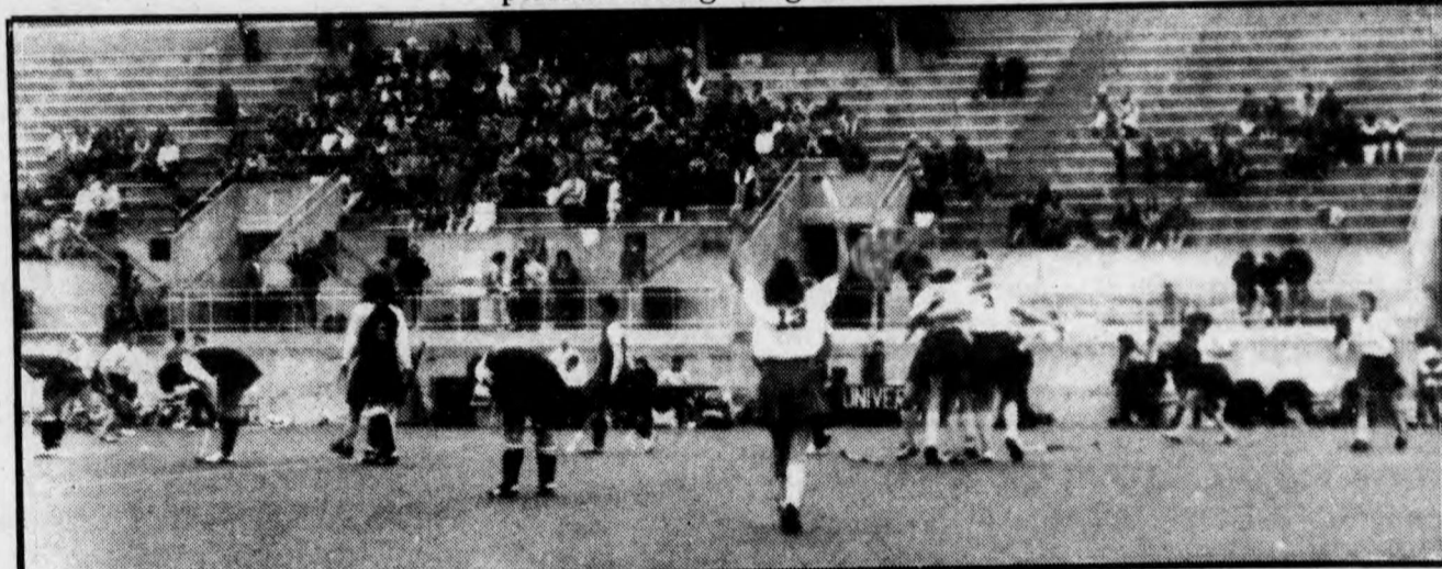
The University of Victoria Vikettes celebrate after defeating the U. of T. Lady Blues 1-0 in the finals to win the Canadian University Championships.

When the referee ruled that UNB was to lose on a single stroke of the ball, it was somehow symbolic of the Sticks' self-proclaimed destiny.