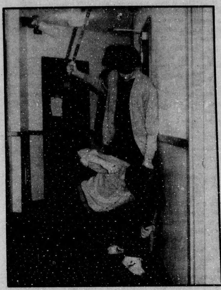
(Above - actual photos of this brutal beating as taken by ace photographer Scott Poodle).

continuing his investigation into the matter and expects to file a report following