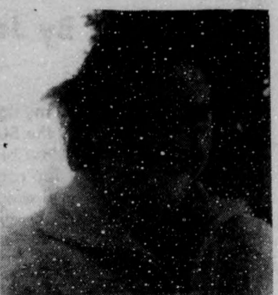
I've been thinking about that for 22 years."