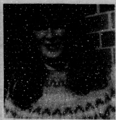
"You don't want to know!"