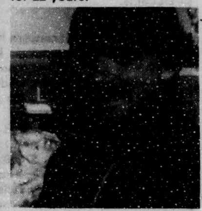
"I don't remember that far