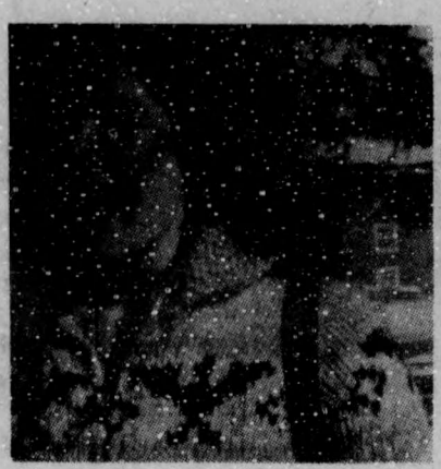
"It depends on who I'm with."