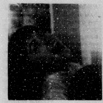
Louise Michaud Arts 2 "How does some big game hunting suit you darling?