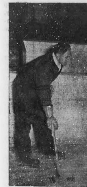
From left to right—Coach