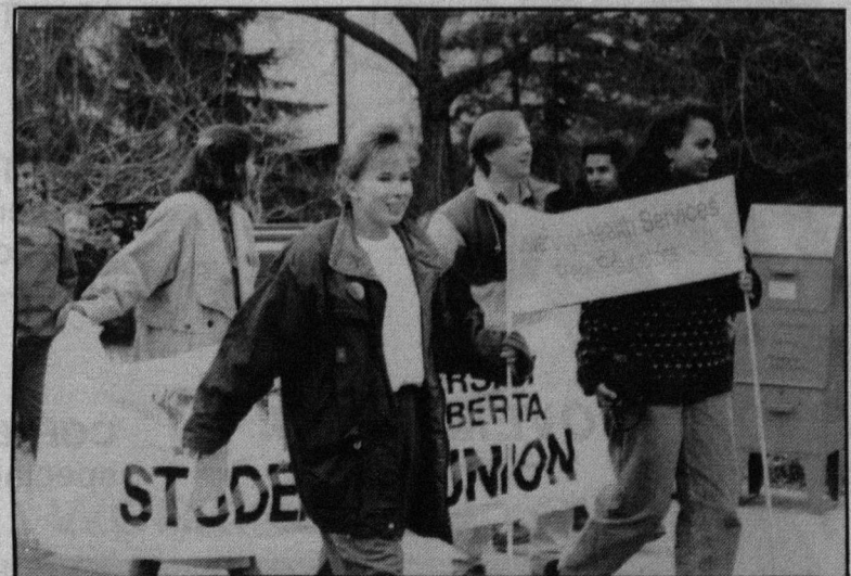
Leading the pack to the Legislature.

This is the first time that Alcohol Awareness Week has been launched on Canadian campuses so extensively, and with so much enthusiasm. If the week turns out to be a success, it will become an annual event, and subsequently, become incorporated as part of the University's programme.