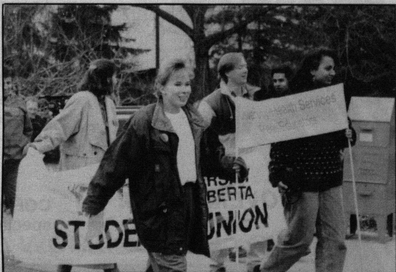
Leading the pack to the Legislature.

This is the first time that Alcohol Awareness Week has been launched on Canadian campuses so extensively, and with so much enthusiasm. If the week turns out to be a success, it will become an annual event, and subsequently, become incorporated as part of the University's programme.