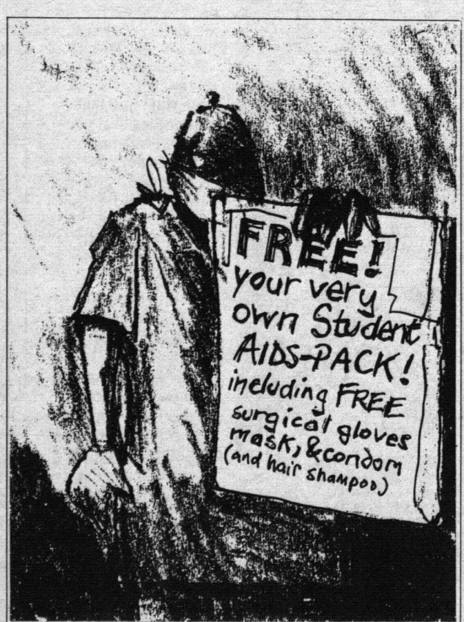
age.4 Gateway scieptember 22:1987

The Gateway is the newspaper of the University of Alberta students. Contents are the responsibility of the Editor-in-Chief. All opinions are signed by the writer and do not necessarily reflect the views of the Gateway. News copy deadlines are 12 noon Mondays and Wednesdays. Newsroom: Rm. 282 (ph. 432-5168). Advertising: Rm. 256D (ph. 432-4241). Students' Union Building, U of A, Edmonton, Alberta, T6C 2G7. Readership is 25,000. The Gateway is a member of Canadian University Press.