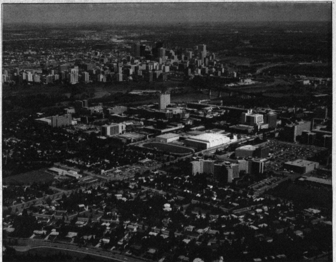
...and the university campus now.