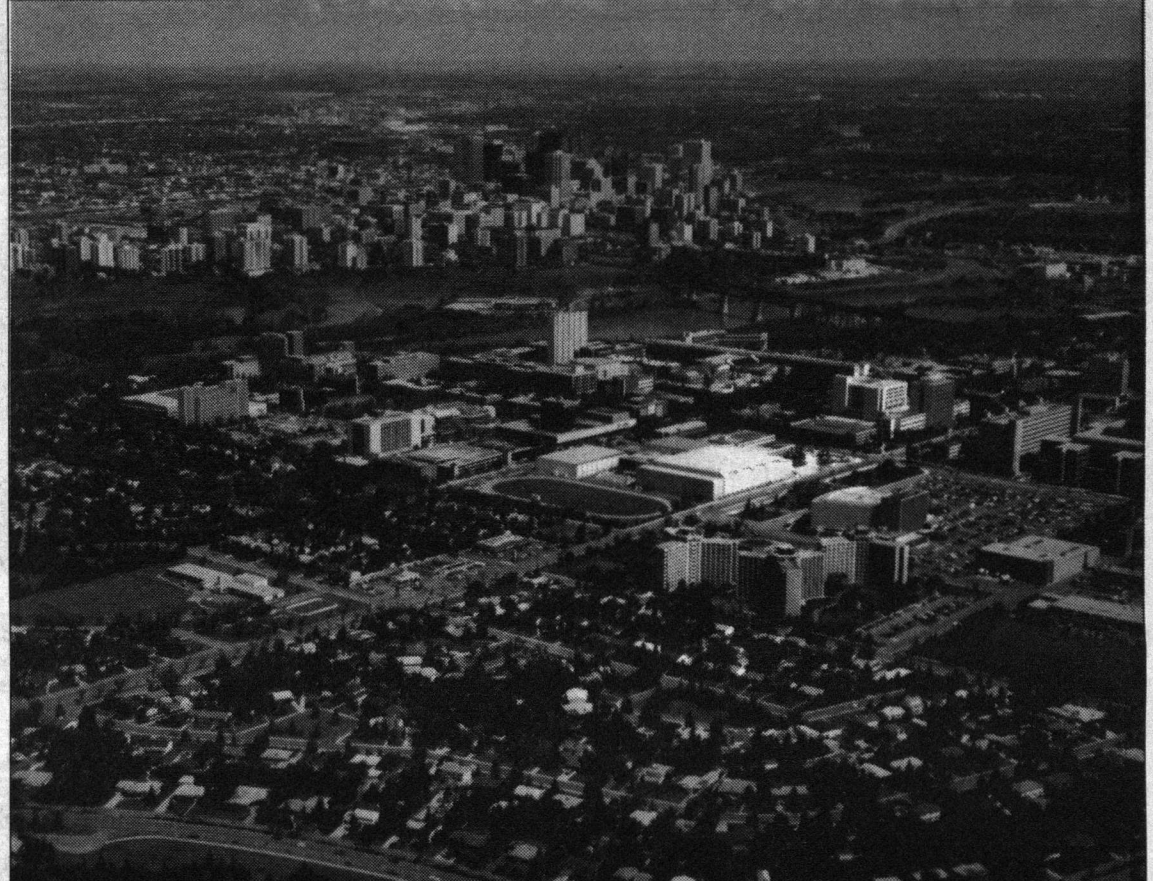
...and the university campus now.