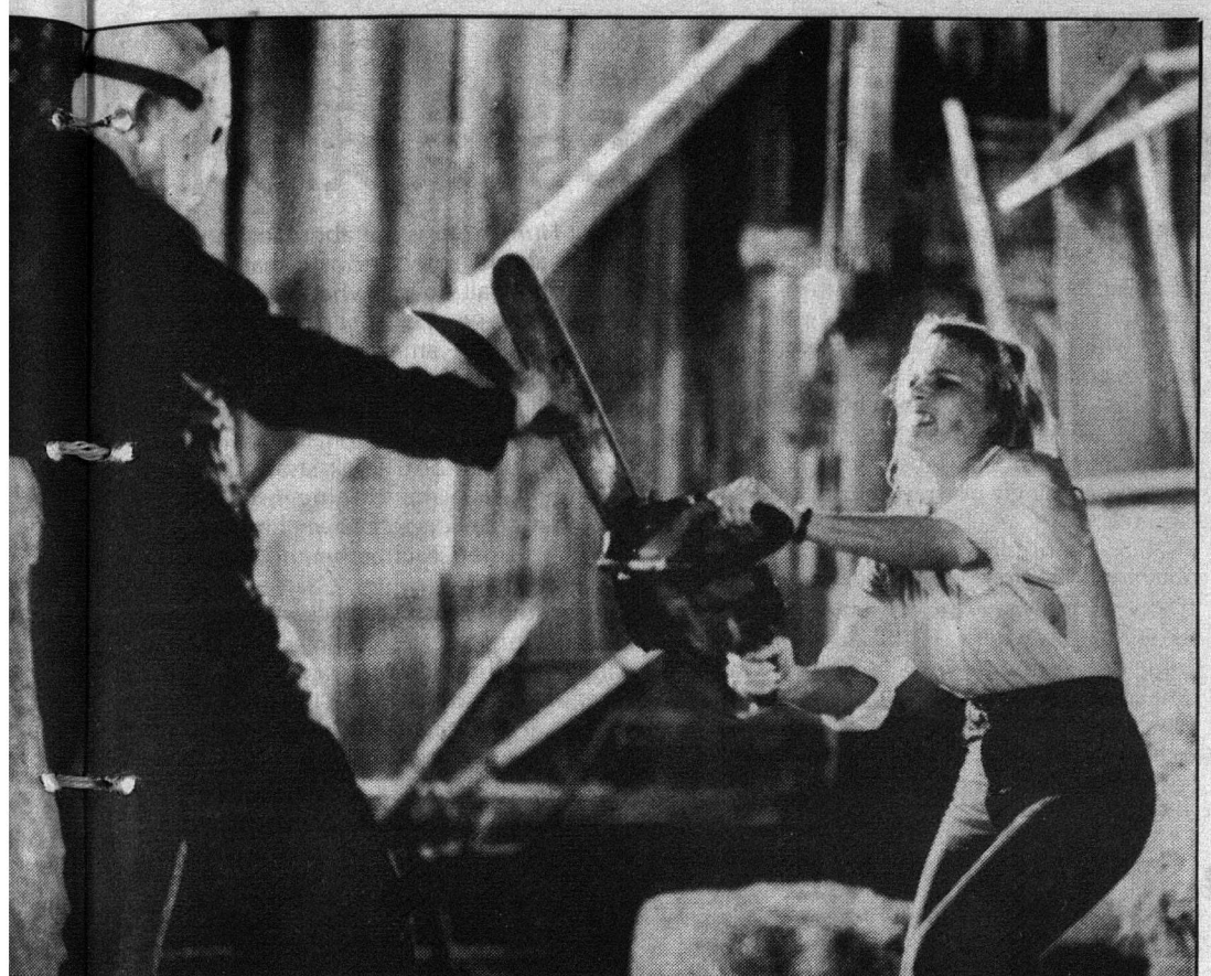
by another potential corpse in another of the endless Friday the 13th series.