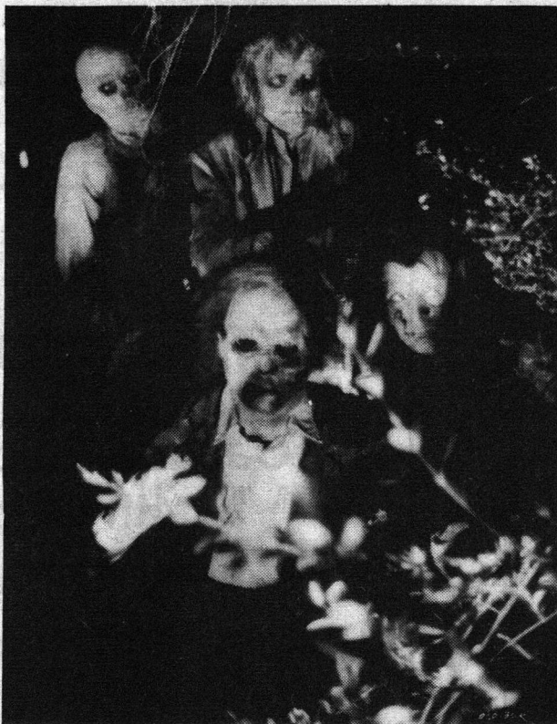
More dead! They are on the move! Yuppies from hell? More bodies again from Return of the Living Dead.

Have you also noticed that the monsters in these films also tend to be lacking in sexuality? Most real-life slash monster murders tend to be sexually motivated, but Jason and his ilk are not molded after the Olsons or Gacys of the world: they are "Pure" killing machines, supernatural beings saving America from its sins of fornication, without the pain of chastity.