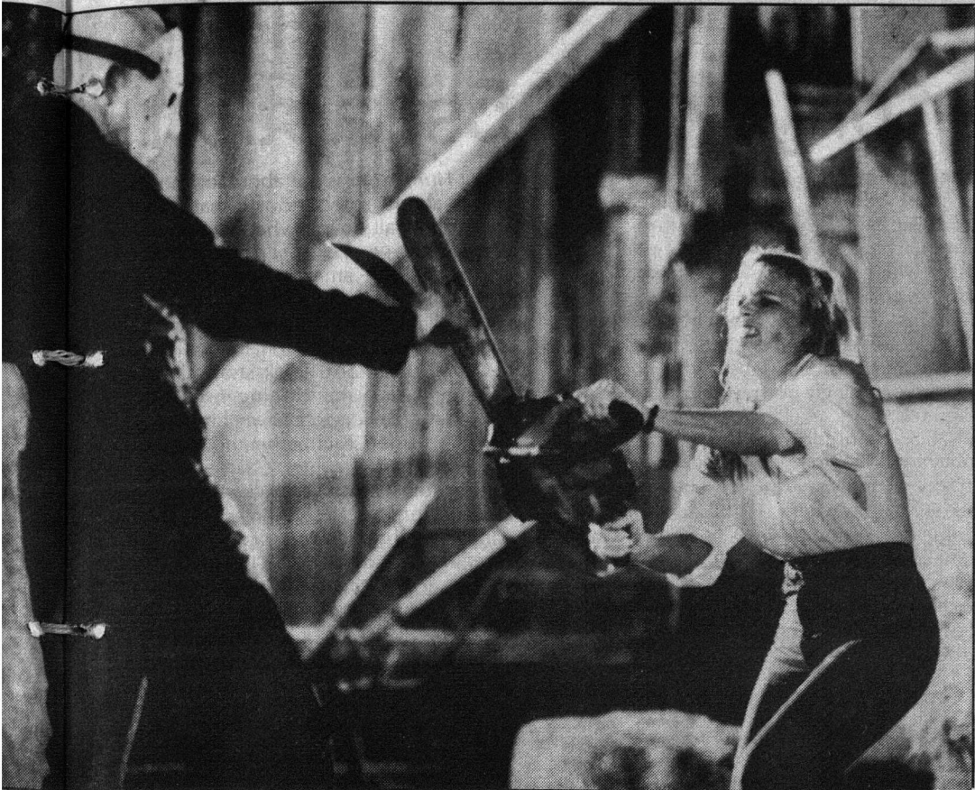
by another potential corpse in another of the endless Friday the 13th series.