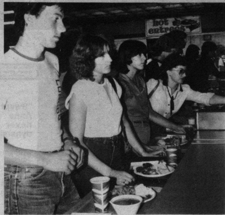
This is not The Soup That Ate Boston but there are those who would disagree.

Since now the problem of food quality seems to be the distributors fault, it might not be easy to solve.