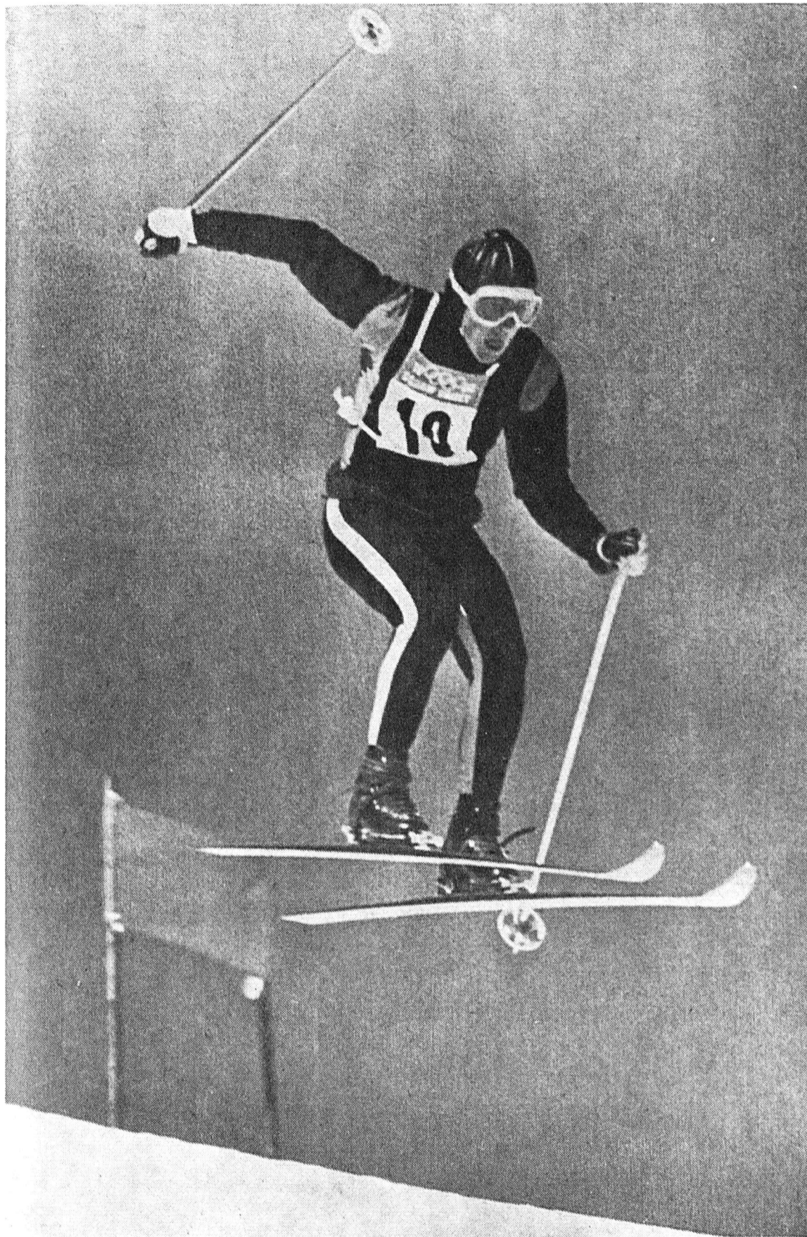
JEAN VUARNET, French Olympic Downhill Ski Race winner.