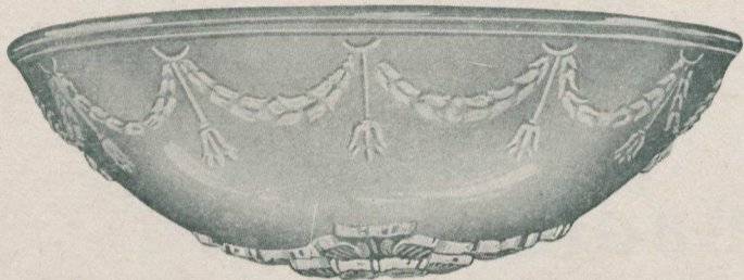
No. 6024. Semi-Indirect Unit

It is the modern way of lighting a house—ininitely more beautiful than the old, and cheaper. MOONSTONE glass so multiplies the light that it is not necessary to use so many high-power lamps.