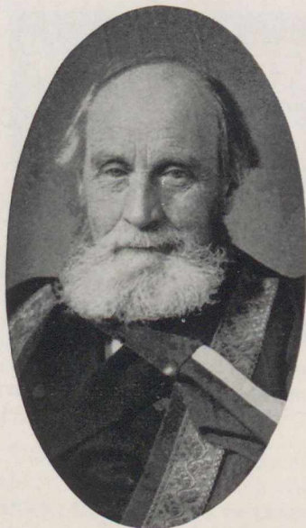
SIR WILLIAM DAWSON 1820 - 1899