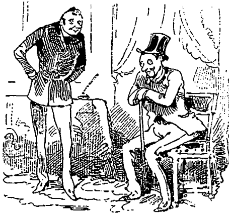
THE HALTON ELECTION.

GRIT—"Ha, Ha! What have you to say about Halton now? Sort of reaction against the Government, don't you think?"