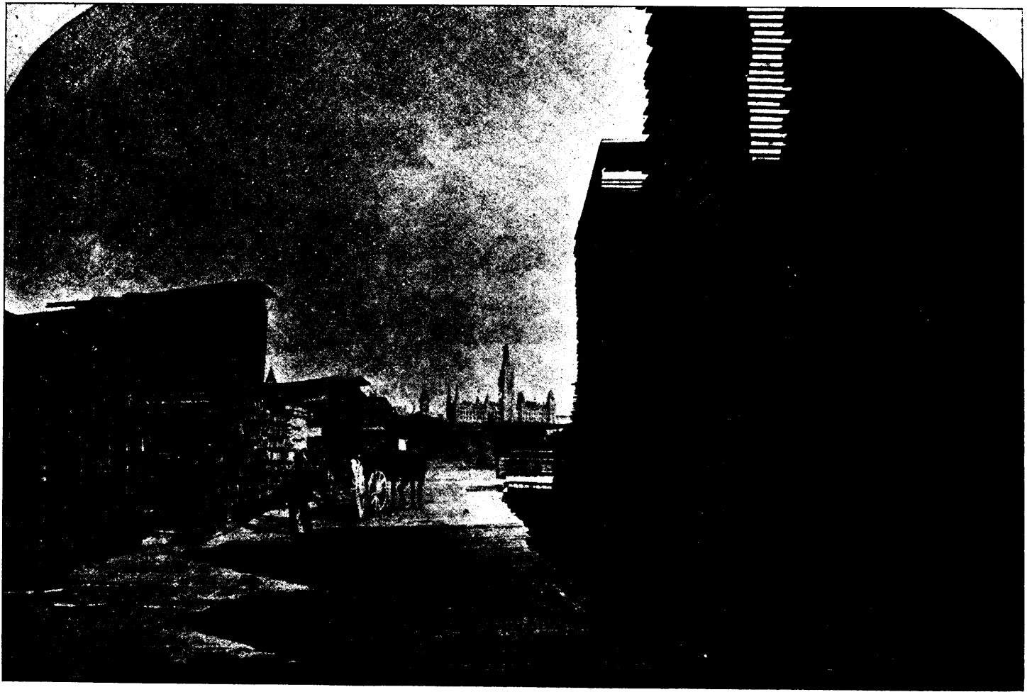
J. R. BOOTH'S LUMBER YARD, OTTAWA.