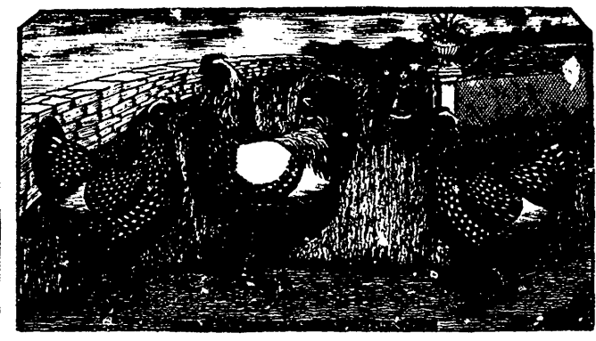
White Wyandotts (Mohegan Strain.)