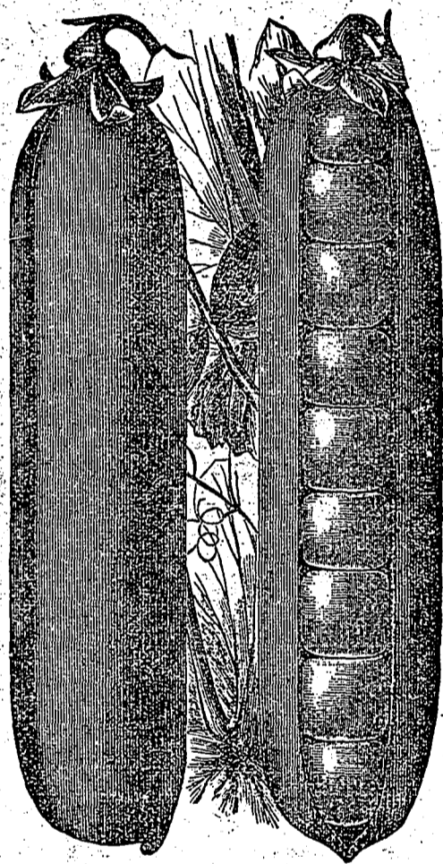
PEAS.—New, The Queen.