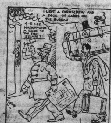
A blue print and a guide to the fire escape.

THE FIRE ESCAPE. The fire escape is a neat, cast-iron substitute for cremation which is designed to stimulate the sale of cork legs. Thousands of excited, night-robed hotel guests have started from the upper deck of a long, spiral fire escape and reached the bottom in perfect safety, only to be greeted by a twenty-two foot drop to the pavement, and a compound fracture of the left hip. For this reason, hotel guests prefer to dive from the seventh floor into a bed quilt than take their chances with the rebound. For some reason which no one has ever been able to discover, the hotel management always locates the fire escape on the side of the hotel which will not be reached by the flames until the following afternoon. This causes guests who have no sense of direction to gallop wildly through the corridors and run into several blind alleys before becoming discouraged and dropping head first out of a window. It will never be really safe to travel in this country until hotel keepers are obliged to furnish a blue print and a rustic guide to guests who take the linen chute into the basement for the fire escape.