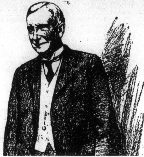
JOHN D. ROCKEFELLER.

Overheard by Lumber Dealer, Who Informed Police—John D. Left For New York.