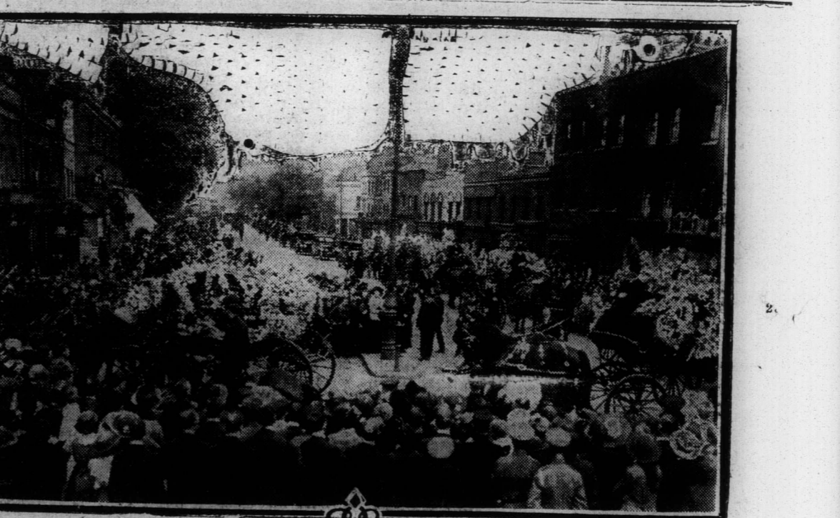
LITTLE VICTIMS OF THE HUNS CARRIED TO LAST RESTING PLACE Another view of the funeral in London of fifteen little victims of the latest Hun raid. A special message was sent by the King. There were over 500 wreaths. Photo shows funeral coaches with their burden of wreaths setting out for the cemetery.

"Well, mate, that's our job!" was the terse comment, as they continued their route.