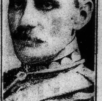
SIR BYRAN T. MAHON A close personal friend of Sir Edward Carson, and the new Command-in-Chief in Ireland.

ing from the Hughes list and doubtless three electoral votes in the doubtful column with Wilson leading.