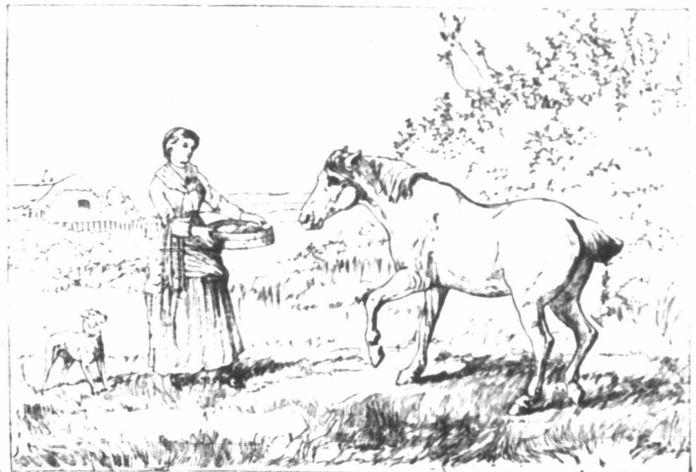
"NOT TO BE CAUGHT WITH CHAFF."—Size 28 x 22 inches.

privileged to accept this great offer, in which case their term of subscription will be extended one year.