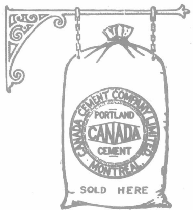
THIS sign hangs in front of nearly all our dealers' stores. Let it guide you to the place where the best cement is sold.

YOU should use "CANADA" Cement because its makers offer you not only the best cement made, but also careful, conscientious, personal assistance in making use of it.