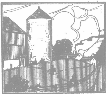
C ONCRETE is the ideal material for barns and silos. Being fire, wind and weather proof, it protects the contents perfectly.

Concrete may be mixed and placed at any season of the year (in extremely cold weather certain precautions must be observed) by your-