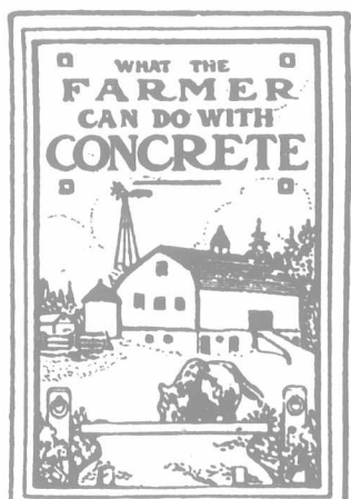
THIS book of 160 pages, handsomely bound and illustrated with photographs, was the first, and is the best work describing the farmers' uses for concrete ever published. See free offer on this page.

I F you haven't received a copy of "What the Farmer Can Do With Concrete," write for it at once. It will be sent absolutely free, without obligating you in any way. Use a post card or clip out the coupon. We will also send particulars of the 1912 Cash Prize Contest. Address: