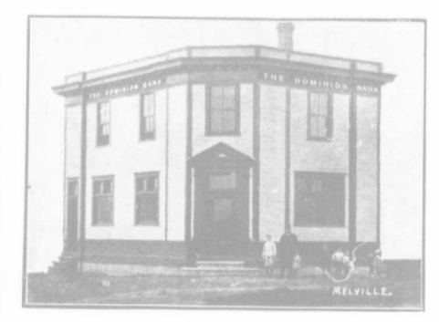
Dominion Bank of Canada One of Melville's Three Banks

In the central business sections lots average from $800 to $2,500, whilst upon the Main Street properties between Second and Third Avenues the sales have averaged $100 per foot. Prices of lots in the residential quarter average from $7.5 to $500 a lot. Recently a corner site, comprising six lots on Main Street, was offered to the town council for the new town hall, at the actual market value of $16,000. Last year a large number of business premises and residences were erected, which, according to official statistics approximated $300,000, Judging from the rate of building activity which now obtains, these figures will certainly not be lessened this year."