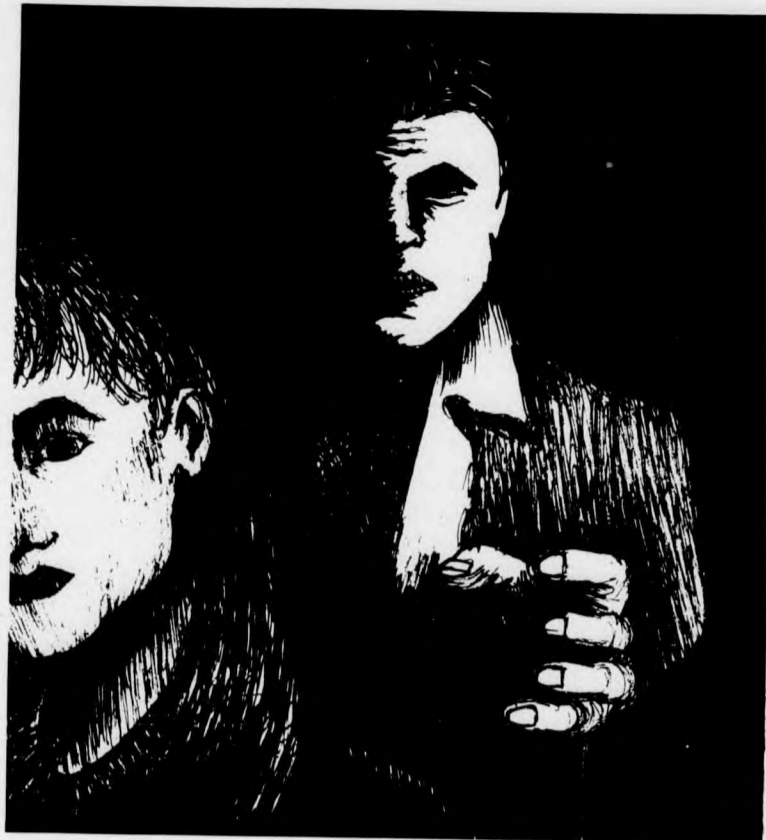
graphic by Desmona Cole