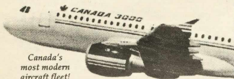
Canada's most modern aircraft fleet!

Come to the Gazette, rm 312 SUB, meetings Mondays at 4:30. Info 494-2507