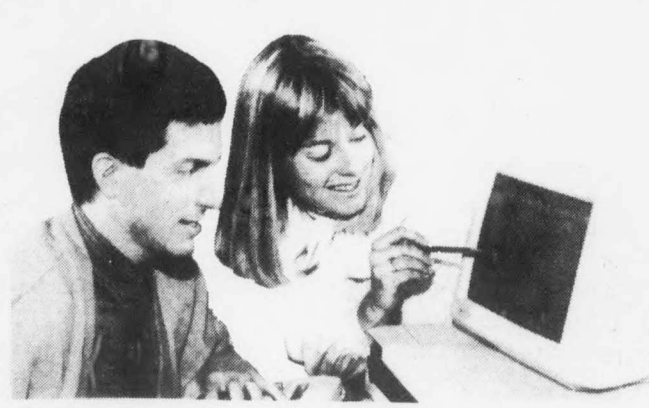
Program 90 Courses

To find out more about Canada's most innovative and fastest growing source of accounting professionals contact: CGA Atlantic Region Educational Association, P.O. Box 5100, 236 St. George Street, Moncton, N.B., E1C 8R2. Or phone (506)857-2204