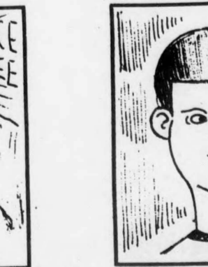
CSIV Chekov I very much like going to Socialist Club with Comrades.