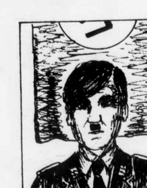
A. Hitler OK, it's no final solution.