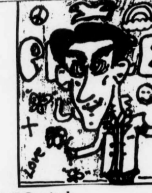
J. BOSnitch No power, just world peace...no really, I have no aspirations for office at all...trust me!