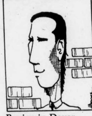
Benjamin Dover AerobicsI It's a cinch. We're going to have more students so we need less classrooms...natchery!