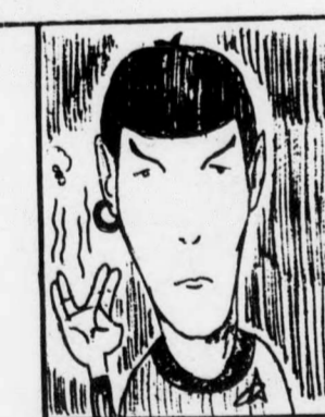
Spock Going to FLAG Society meetings and playing video games.