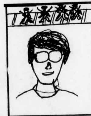
Bernard Goetz Vigilantel Do they ride the subway?

What do you think of FLAG? by Sanjay Singhel