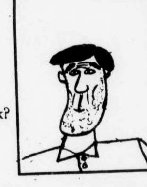
Brian Mulroney Where's New Brunswick?