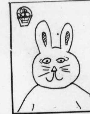
Easter Bunny He should be compassionate and be able to chew gum and sing along to The Doors.