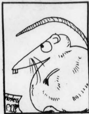
Subrat I don't pay rent.

What do you think of the rent controls being dropped