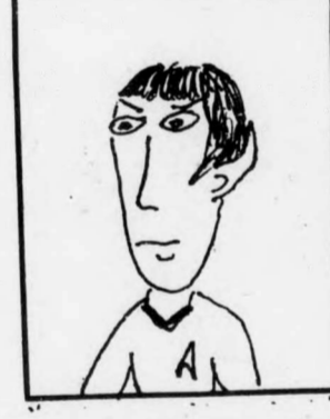
Mr. Spock Yes, longer arms would distract attention from my ears.