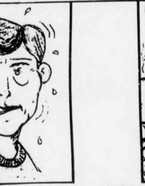
Bones Fermenting some of the finest dog bile this side of the St. John River.