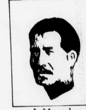
J. Mengele : It's incomplete - there's still too much space for humans.