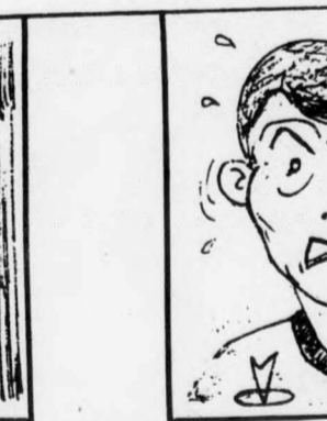
PhilosophyI At the moment, getting myself out of this test tube from the sperm bank, Thank you!