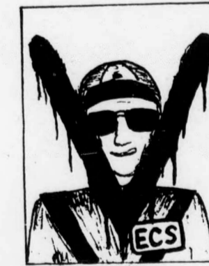
The visitors We liked ours