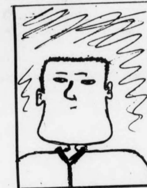
Chem Eng XV I'll be making and selling chemicals this summer, want some?