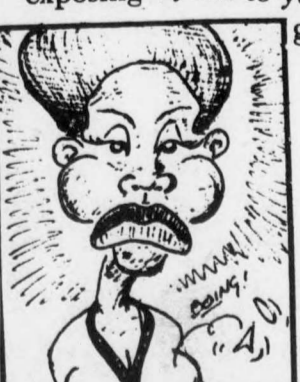
Uhuru GynecologyII running ganja from Jamaica