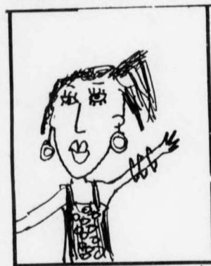
Cyndi Lauper No way - I have enough trouble with two arms.

Should the gov't be allowed to increase our arms?