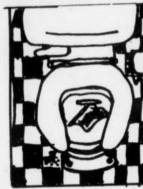
Bag of NB Legislature Gold Advance notice of RCMP raids on Dick's office.