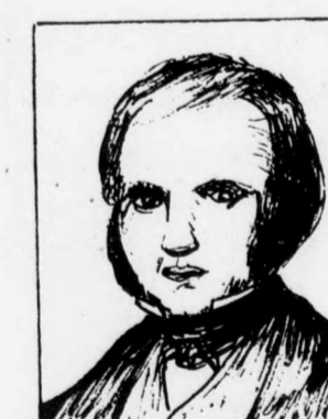
C. Darwin It seems devolutionary