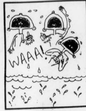
Poor UNB Students Sob, Sob, Sob!