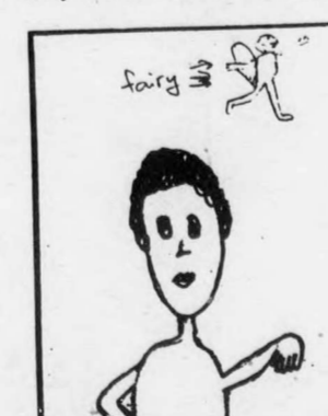
Anonymous Ch Engl Ah, but what does FLAG think of me?

What's your favourite punchline? by Mike Pringle