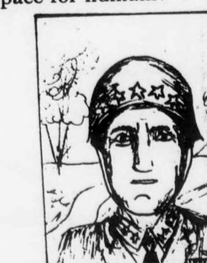
Gen. Westmorland You gotta rationalize the body-count.

What do you think of the proposed space re-allocation