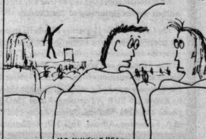
MR. KNUCKLE HEAD

'SCUSE ME, DO YOU HAVE THE NOTES FOR THE PAST THREE MONTHS?