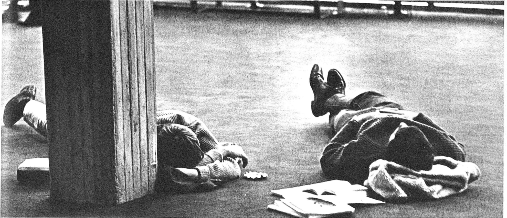
ARTS FACULTY TEACH-IN... ...ZZZZZZZZZZ??