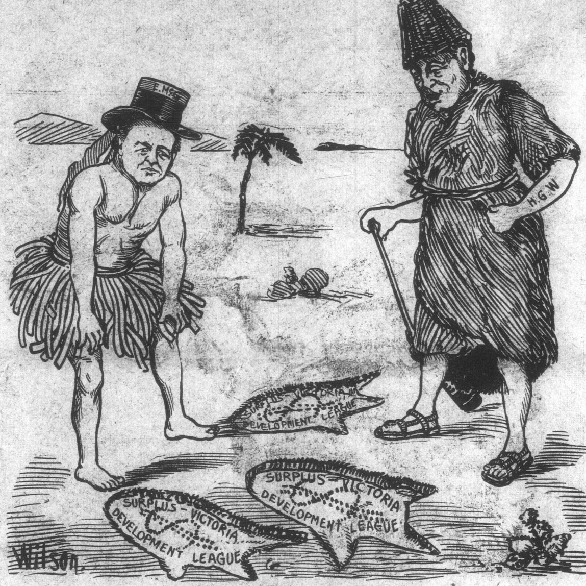
A DISCOVERY BY THE ISLAND EXPLORERS.

the city engineer was instructed to insurance.