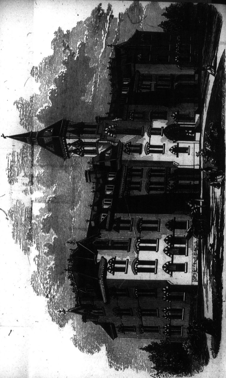
DEAF AND DUMB INSTITUTION.