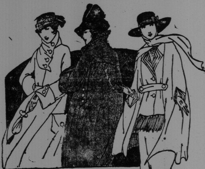
Our Mail Order Service is Splendid