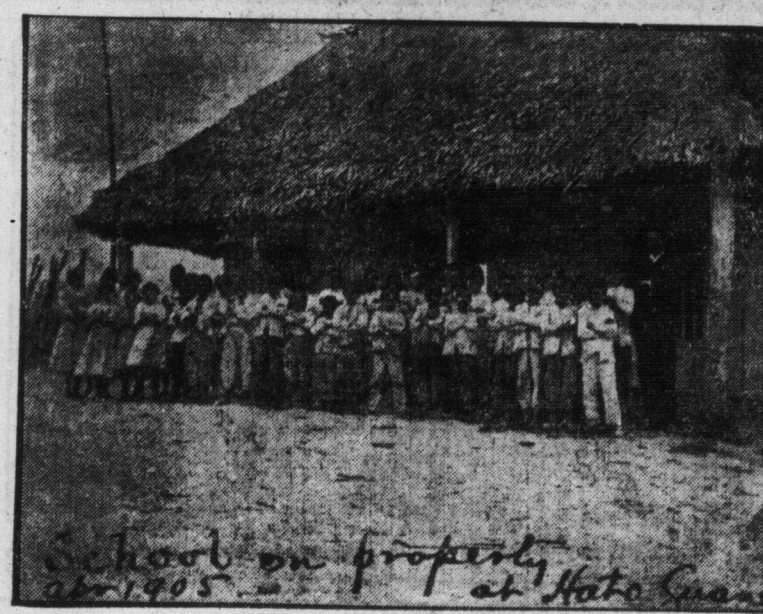
SCHOOL HOUSE AND SCHOLARS ON OUR PROPERTY.

If you would like a home there, apply to