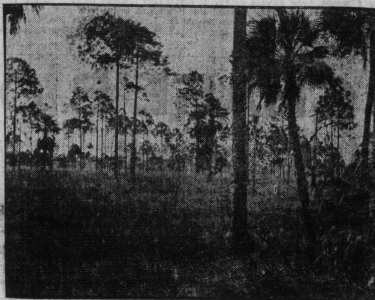
AN AVERAGE OF THE COMPANY'S LANDS.

A QUALIFIED MEDICAL PRACTITIONER WILL BE IN CHARGE OF THE COLONY.