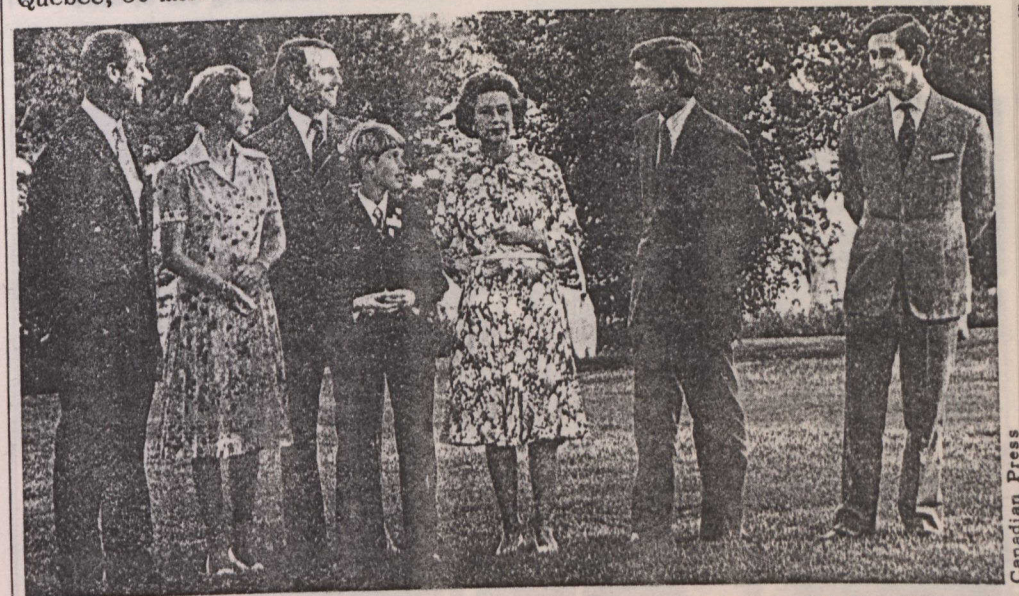
In Bromont, Quebec for the Olympic equestrian events on July 25, the entire royal family assembled in one place for the first time outside Britain.

"No one can visit Montreal without being conscious of its cultural dynamism, and without being aware of its central role in the preservation of the French language and culture in North America. The constant inter-action of two proud peoples living together in