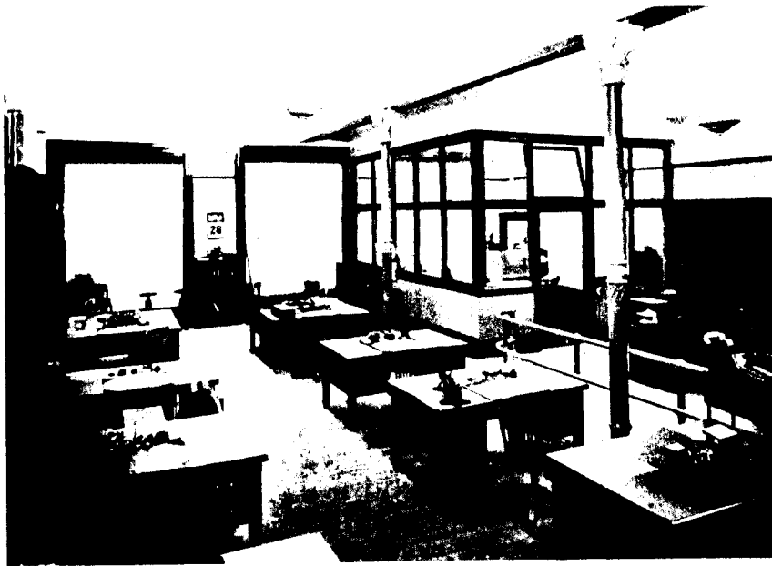
Actuary Dept., Head Office, Canada Life Assurance Company. Photograph taken at night, with no other illuminant but Alexalite.

An office requires a clear, soft light, evenly distributed to every part of the room, and free from shadows.