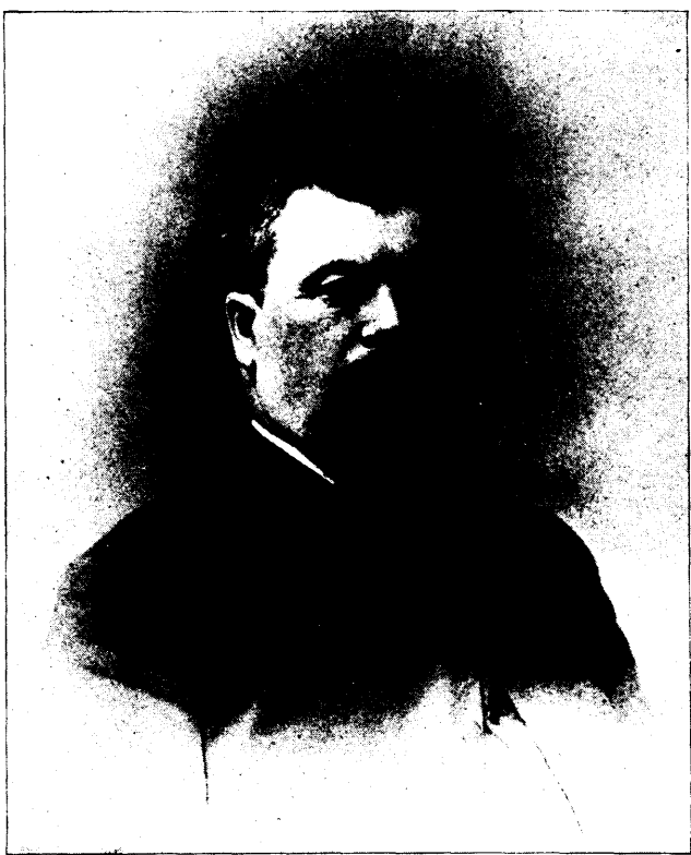
THE HON. THOS. GREENWAY, PREMIER OF MANITOBA.