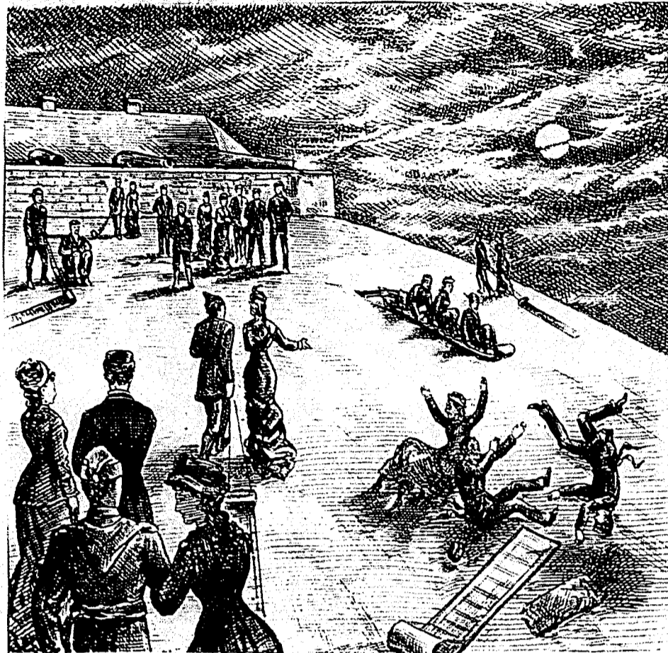
TOUGANING AT FORT HILL, KINGSTON.

Will be mailed FREE to all applicants. 31 cent. 1 colored plate, 500 engravings, about 150 pages, and full descriptions, prices and directions for planting over 1200 varieties of Vegetable and Flower Seeds, Plants, Roses, Etc. Invaluable all. Send for it. Address: D. M. FERRY & CO., Detroit Mich.