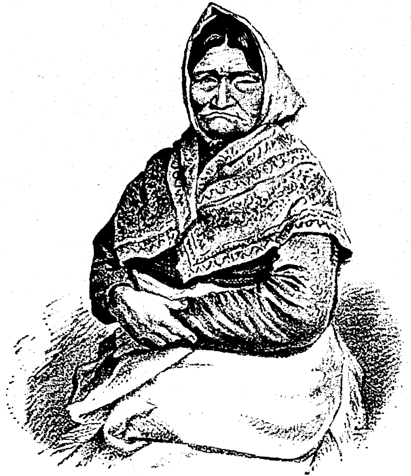
"OLD BETS," A SIOUX SQUAW.