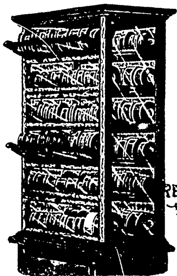
No. 2 CABINET (opens from two sides).

No. 0, size 28 x 7 x 27, 50 bolts. No. 1, size 28 x 15 x 27, 100 bolts. No. 2, size 28 x 15 x 38, 150 bolts. No. 3, size 28 x 20 x 38, 250 bolts. No. 4, size 28 x 25 x 38, 325 bolts. No. 5, size 28 x 31 x 38, 400 bolts.