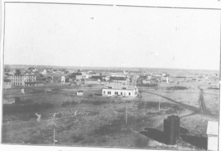
THE TOWN OF WAINWRIGHT, ALBERTA, MAY 1911.