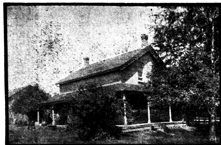
SMALLER RESIDENCE, VALUED AT $2,500.00.

It is just a five-minute ride on the Wellington street cars south from the corner of Dundas and Richmond streets to within 300 yards of "Springwood Park." Come and enjoy the cool breezes under the shades of Springwood Park's magnificent grove of gigantic shade trees. To do so will convince you that there is no healthier spot upon which to locate your home. All are welcome. Our representative is on the property all the time and will be at your service.