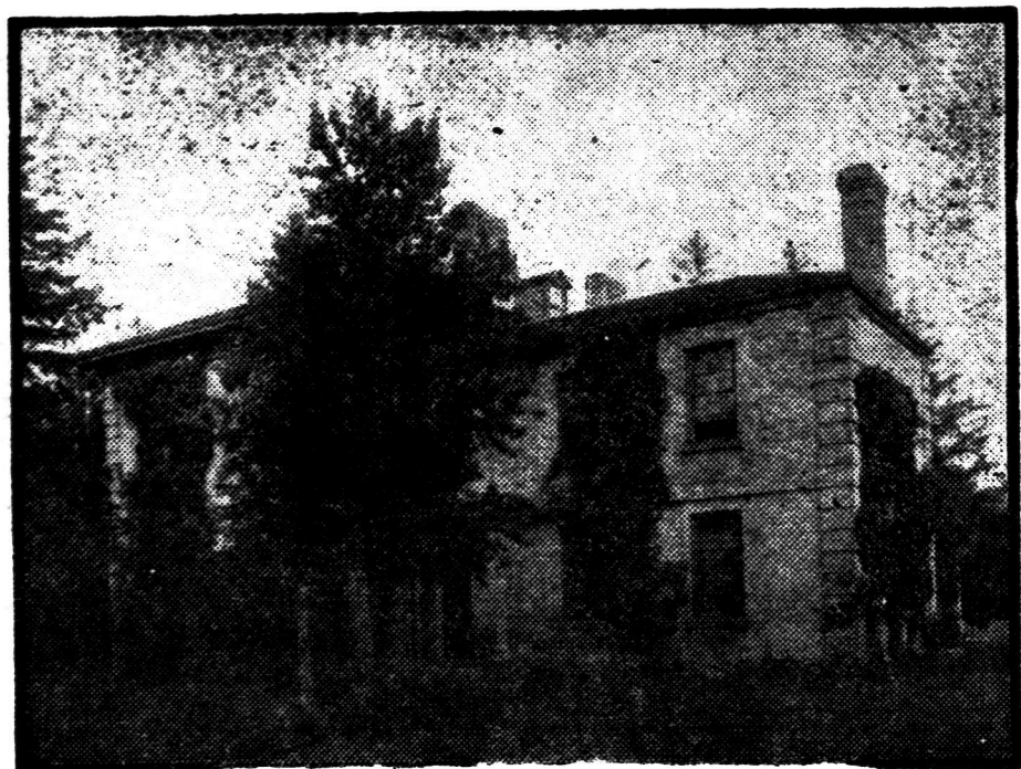
SIDE VIEW OF THE $15,000.00 RESIDENCE