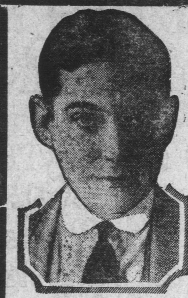
Carter De Haven

COMING—LARRY SEMON in "A PAIR OF KINGS,"