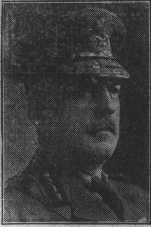
Who won a victory for the Conservative party in Hamilton.