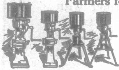
FOUR MODELS—15 SIZES

There is only one "Melotte"—The "Melotte" that we have been selling to Canadian Farmers for 25 years.